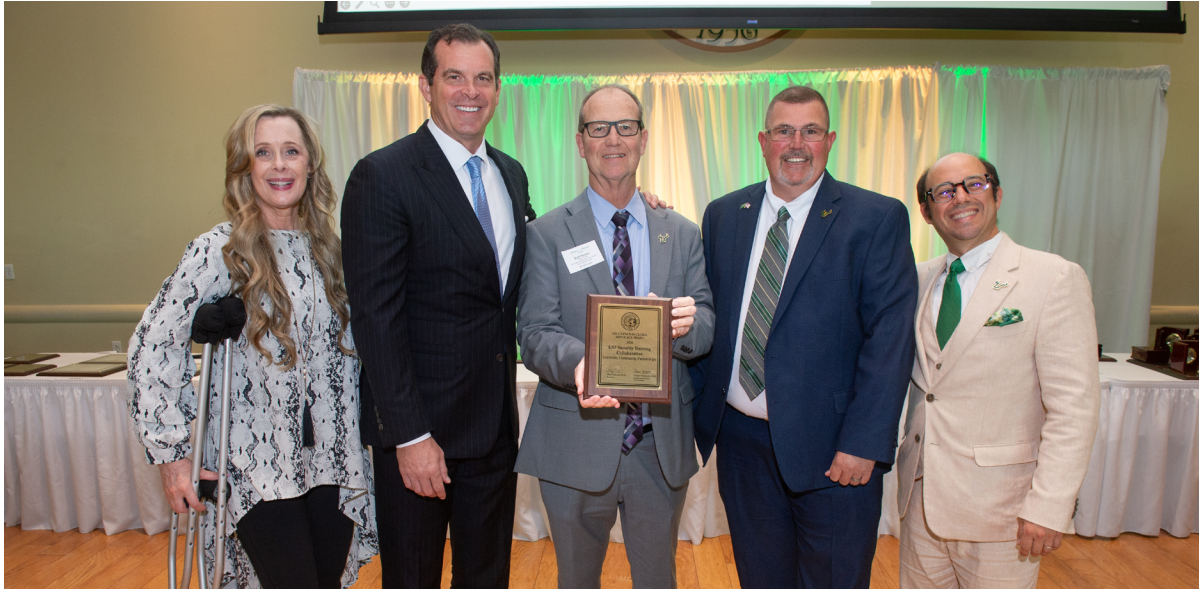
USF presents 2026 Global Excellence Awards honoring international impact